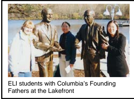
ELI students with Columbia's Founding Fathers at the Lakefront

We think that you chose a great place to live while you are here in the United States. Columbia has all the beauty of a small city and the convenience of being located between two big cities.