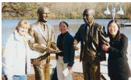
ELI students with Columbia's Founding Fathers at the Lakefront